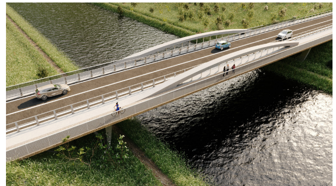
Canal crossing bridge

Various storm water basins will be built, as well as a temporary immersion zone at the confluence of the Vraimont and Saint-Jean rivers to prevent the risk of flooding.